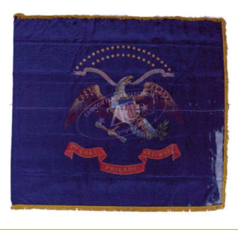
ZFC0406 Regimental flag of the 2nd Philadelphia Coal Exchange Regiment. U.S. Volunteer Infantry, 1863. This flag is a Regimental Color from the Philadelphia Department of Pattern. Made especially by Evans & Hassell for the 2nd Philadelphia Coal Exchange Regiment, 51st Pennsylvania Militia by its sponsors, of the Philadelphia Coal Exchange.