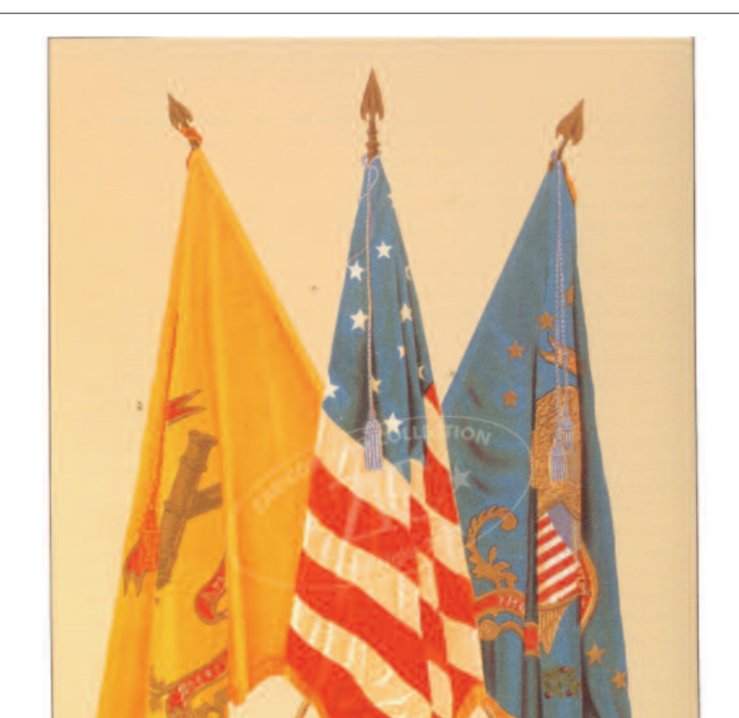
ZFC2733 Frontispiece of Flags of the Army of the United States carried During the War of Rebellion, 1887 - the landmark work on Civil War flags. This volume identifies the flags used by the Union Army during the Civil War. It was written, illustrated and assembled under direction of the US Army's Quartermaster General in 1887 with a copyright date of 1888, it contains 89 total prints, including two shown prior to the title page.