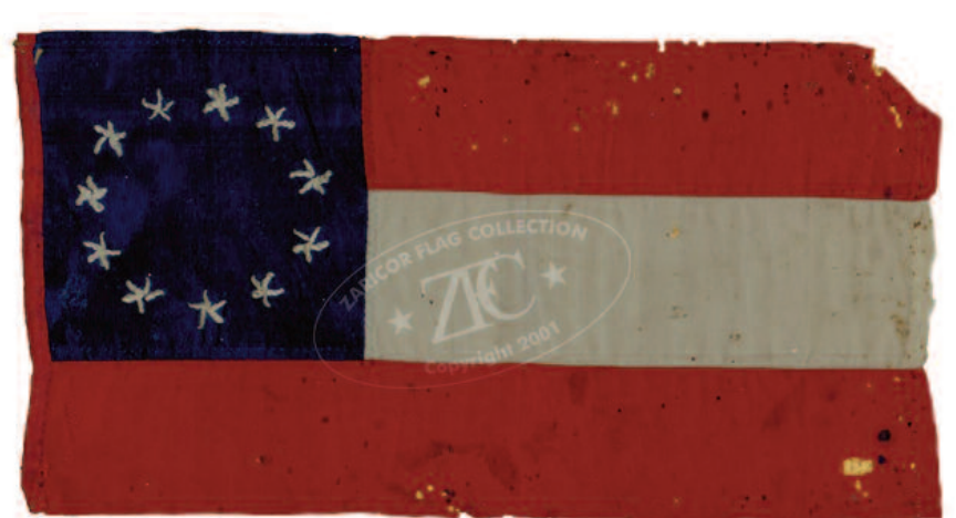
ZFC0002 Confederate States of America 11 Star Bible Flag, 1861-1863. Flags like this small 11 star Confederate Flag are often referred to as bible flags. They were common to both Union and Confederate sides during the American Civil War.

The Great Seal of the Confederate States of America was adopted to embody the Confederacy's aspiration that the South had retained the original intents of the Founding Fathers while the North has not. Accordingly they chose, as the most prominent feature, the equestrian statue of General George Washington, from the Virginia Washington Memorial, that stands in front of the state capitol building Richmond, Virginia. To the Confederacy, Washington symbolized the American ideal. Washington is surrounded by a wreath of the bounty of the primarily agrarian South; cotton, tobacco, rice, corn, sugar cane and wheat. The date 22 February 1862 refers to the date of inauguration of the only President of the Confederacy, Jefferson Davis, coincidentally on Washington's birthday.