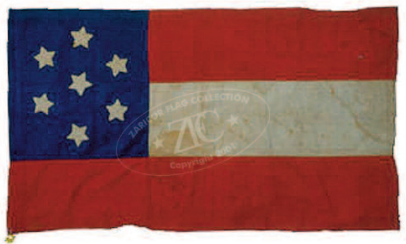
ZFC0180 7 Star Confederate 1st National Camp Flag, March - April 1861, former Star Spangled Banner Flag House Collection. This flag bearing the first Confederate National pattern was authenticated by the Smithsonian Institution and examined by Howard Madaus who identified it, most likely, as a camp flag.