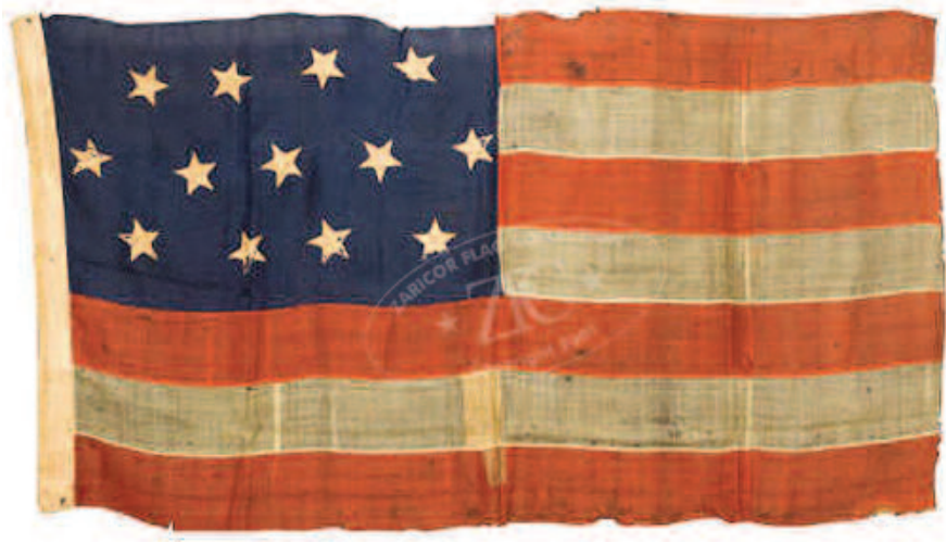
ZFC2486 13 Star Confederate States of America Provisional Flag - made while Confederate government still forming. While the recently seceded states met in Montgomery to form a new government and select a new national, patriots and entrepreneurs alike made provisional flags representing the seceded states.