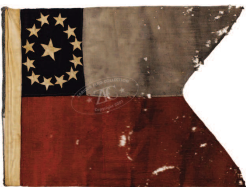
ZFC2499 13 Star, Confederate States of America - Lt. Artillery - reverses traditional U.S red over white, with staff, 1863, extremely rare 1 of 2. Captured at Fort Hindman A very rare swallowtail Confederate guidon with its original blue lanyard. It was originally discovered furlled around its staff with its red painted tin "halberd head" finial.