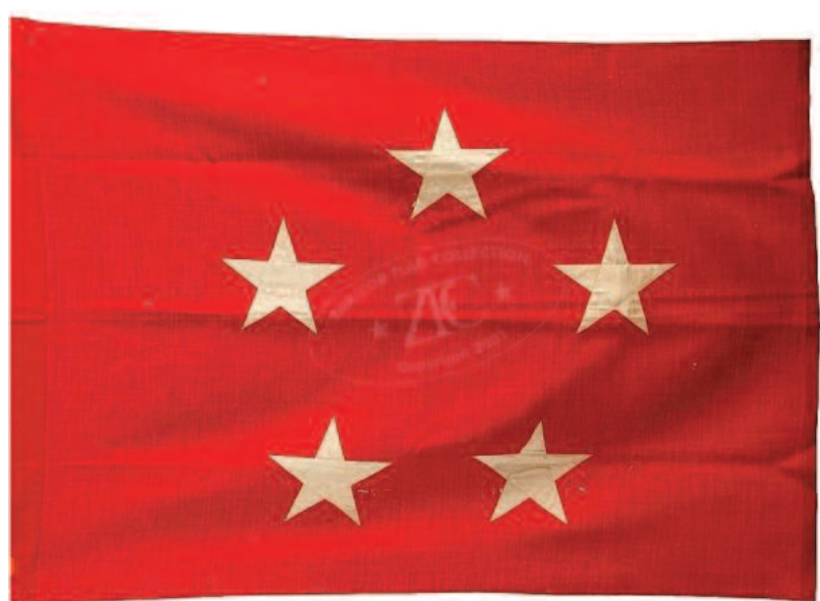
ZFC3275 U.S. Army General of the Army Personal Flag, 5 Stars, 1944-1945, WWII. This extremely rare, wool, five-star rank flag designates the personal presence of General of the Army, the highest possible wartime grade in the United States Army.