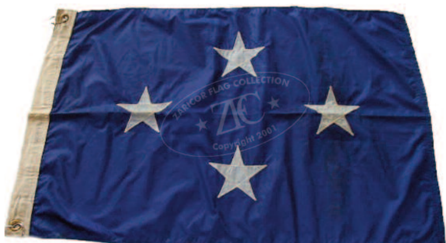
ZFC0978 A full Admiral's flag dating from the Vietnam War Era, 1966 – 1975. This nylon Admiral's Flag bears the four stars of his grade. It dates from the Vietnam war era. It would have been used for display on small boats and Admiral's barges; however the officer whom it represented is still unknown.