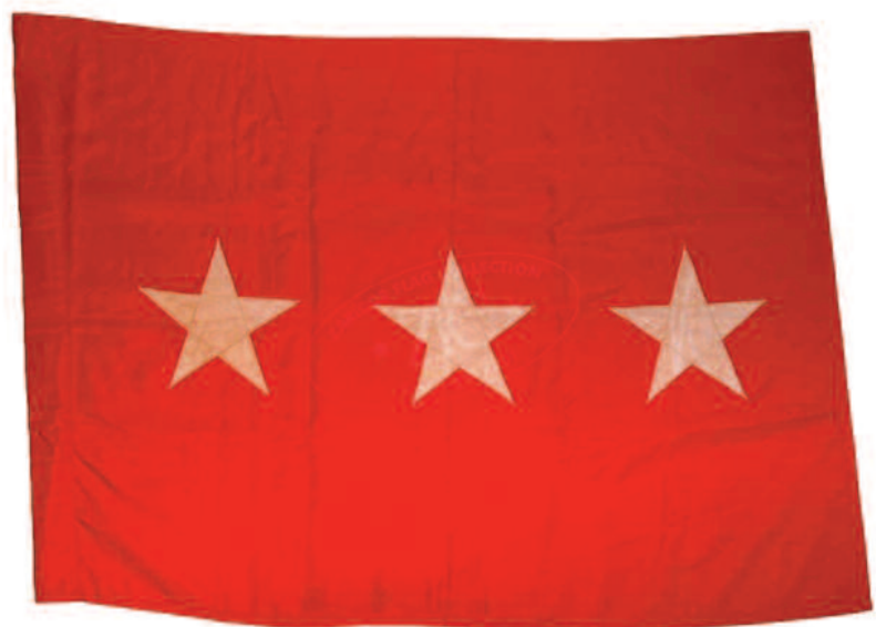
ZFC1273 U.S. Army Lieutenant General Personal Flag, Gen. Ridgway, Deputy Chief of Staff, Pentagon, 1945-1951. This flag was used by Lieutenant-General Matthew B. Ridgway from his appointment to that rank on 4 June 1945, at the close of World War II, until taking command of U. N. forces on the Korean Peninsula as a full general in April of 1951.