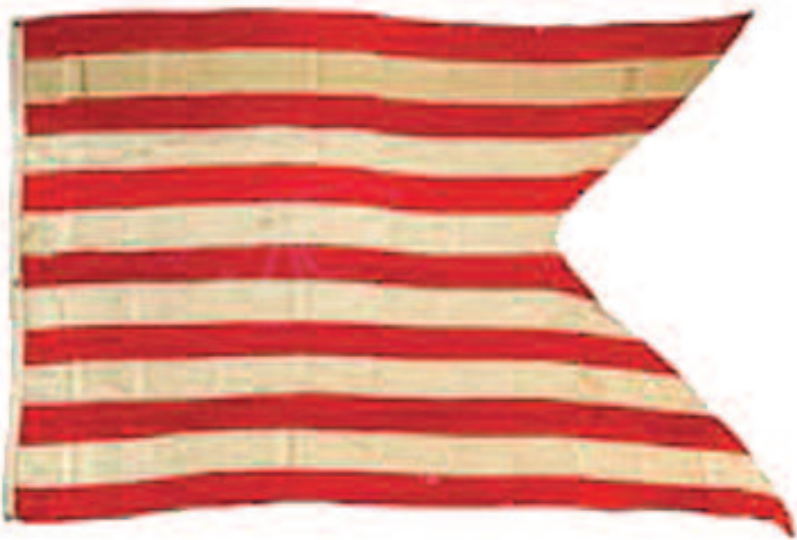
ZFC3543 U.S. Navy Commodore's Broad Pennant, Commodore Stephen Decatur, 1869-1876. This is an extremely rare Commodore's Broad Pennant used by the U.S. Navy for a brief period. During this period, the U.S. Navy abandoned its system of blue flags bearing the appropriate numbers of stars for an admiral's grade, replacing it with 13 stripe flags, some defaced with red stars.