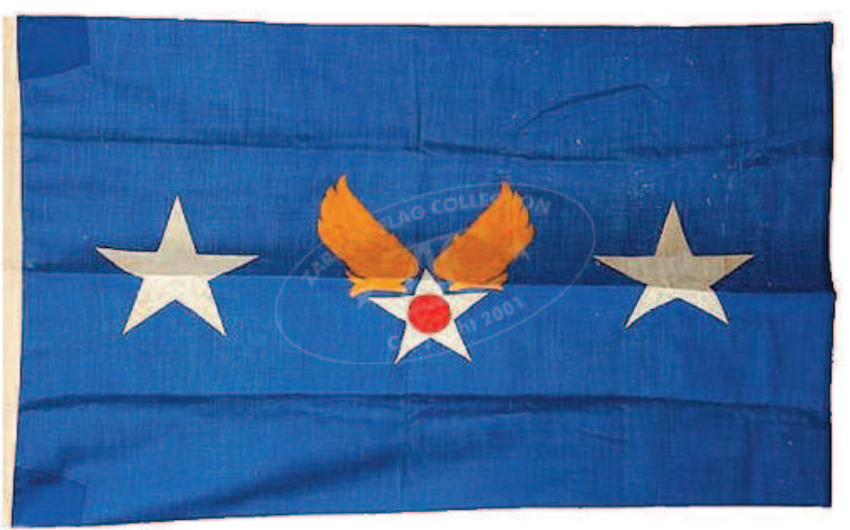
ZFC3282 U.S. Army Air Force, Major General's flag, Hoyt S. Vandenberg, Deputy Air Commander-in-Chief, S.H.A.E.F., HQ, 1944. This is a large linsey-woolsey flag exhibiting blue field with Army Air Corps insignia in center with star to left and right, flag measures 35" x 64" and presents canvas pole sleeve with interior leather tabs as well as grommets at top and bottom.