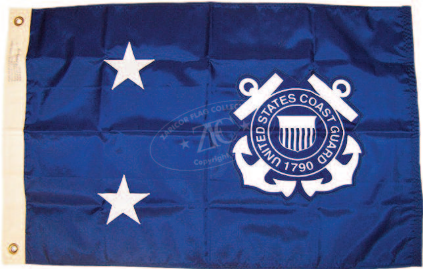
ZFC2468 U.S. Coast Guard Rear Admiral Flag - Upper Half, 1960s. This U.S. Coast Guard, size 5, Rear Admiral (Upper Half). Coast Guard personal flags are used according to the same rules followed by the Navy, serving as a distinctive mark in lieu of the commission pennant when a flag officer is on board a ship.