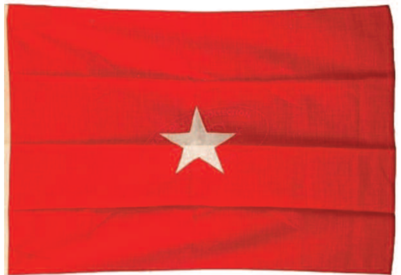
ZFC3283 U.S. Army Brigadier General Personal Flag - Gen. Hesketh, Military Mayor of Berlin. This U.S. Army, Brigadier General Personal Flag was used by Brigadier General William Hesketh, in 1947, when he served as the "Military Mayor" or City Commandant of Berlin's American Sector under the Allied Military Government of Germany.