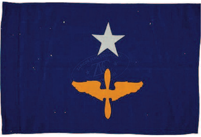
ZFC3696 A U.S. Army Air Corps Brigadier General Automobile flag, 1930s. This flag was made to identify the vehicle of a brigadier general on the staff of that corps. All general officers of the corps staff were authorized a field and boat flag as well as a car flag, and this is an example of the later. The Philadelphia Quartermaster depot made it in 1939.