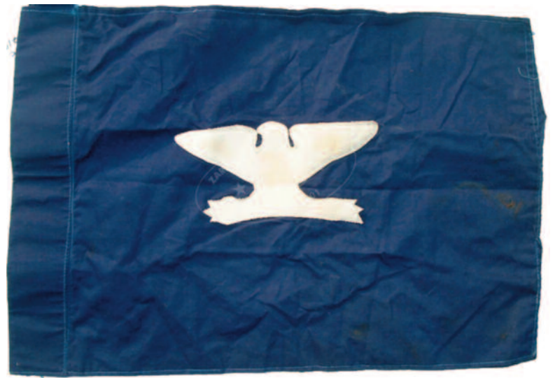
ZFC3217 U.S.A.F. Base Commander Automobile Flag, 1970s. This small blue, worn cotton flag, with a machine-sewn silhouette of an American colonel's eagle, is not an item of US Air Force (USAF) issue but rather a "Base Made" interpretation of a Base Commander's flag, or at least how one ought to look.