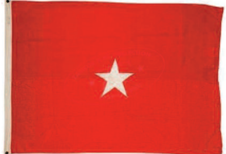
ZFC3583 USMC Brigadier General Personal Flag - Gen. Alexander A. Vandergrift, 1940-1942. Marine Corps General Alexander Vandergrift's Brigadier General's Flag with Signed Card from the Naval Relief Fund Auction. Hero of Guadalcanal, Medal of Honor Winner, and Commandant of the Marine Corps, Alexander A. Vandergrift was the epitome of a Marine.