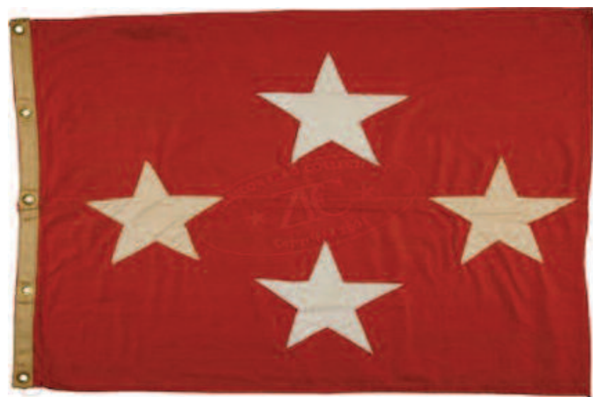
ZFC3697 Commandant of the U.S. Marine Corps Personal Flag - General Cates. This flag was hoisted to indicate the presence of General Clifton Bledsoe Cates at the naval funeral service of the Chief of Naval Operations Admiral Forrest Percival Sherman aboard the U.S.S. Mount Olympus.