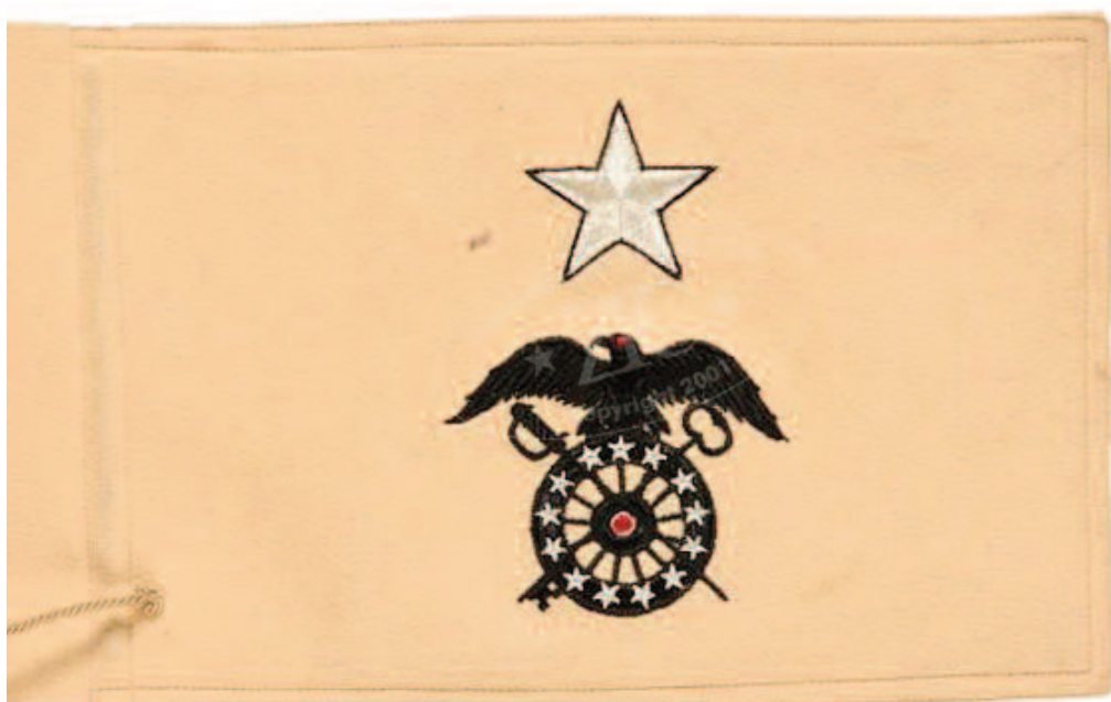
ZFC3281 U.S. Army Brigadier General Quartermaster Corps Automobile Flag, 1930s. This example was made to identify the vehicle of a brigadier general of that corps. All officers of the general staff were authorized a field and boat flag as well as a car flag, and this is an example of the later.