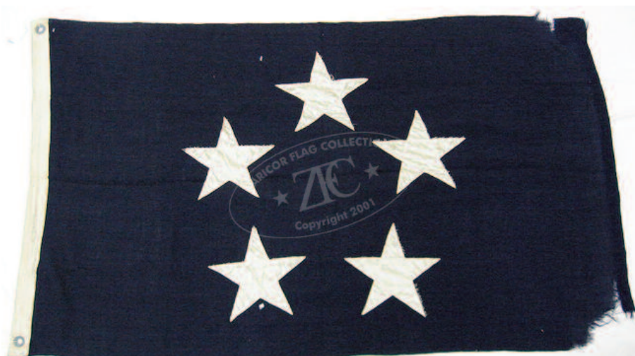
ZFC3288 U.S. Navy Fleet Admiral's Personal Flag, 5 Stars, 1944-1945, WWII. This well worn, dark blue wool rank flag defaced with five white stars is unmarked and does not reveal which of the four men entitled to it, as Fleet Admirals, might have displayed it during WWII.