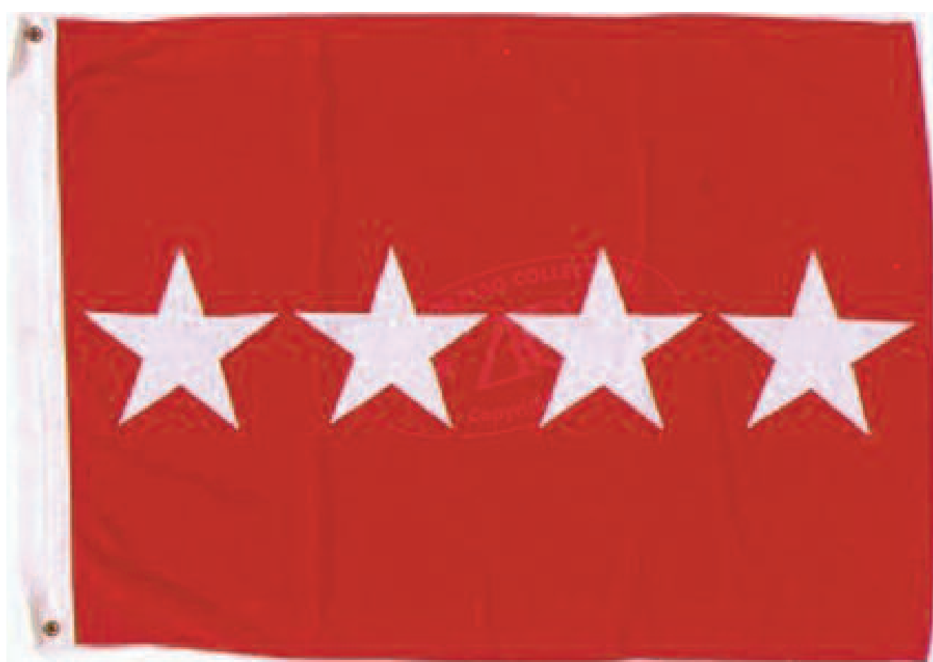
ZFC0518 U.S. Army General Personal Flag, Robert Eicherberger, 4 Stars, 1944-1945, WWII. This is a U.S. Army designating field flag for the grade of full general, which belonged to General Eichelberger. In the United States Army all general officers are entitled to display personal rank flags and a corresponding National Color.