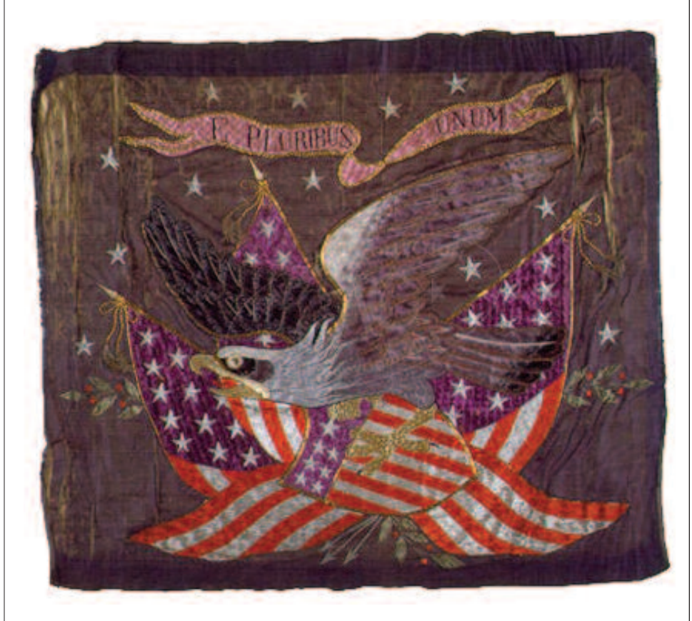
ZFC0289 U.S Trapunto with American Symbols featuring the American eagle with arrows and olive branches, three United States flags, an American shield and scroll with E Pluribus Unum with 13 stars seme in the background, from the early 1900s.