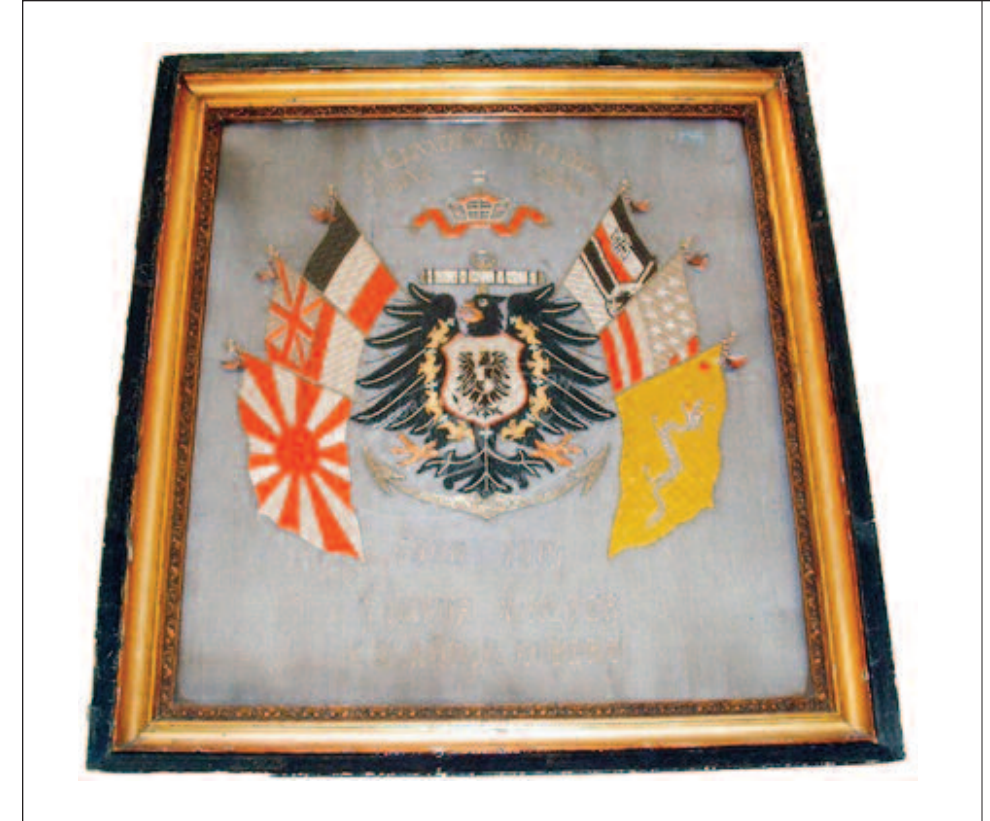
ZFC2429 Imperial German Maritime Trapunto featuring the Imperial German arms on an upright anchor with panoply of international ensigns from the maiden voyage to the Far East of the SS König Albert dating from 1900 to 1901.