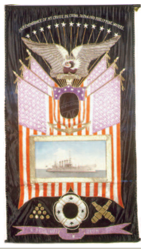
ZFC1489 American Naval Trapunto containing a design introduced in 1908 for the visit of the Great White Fleet to Japan. This updated piece features 48 star flags and an embroidered image of the USS Tennessee, dating from 1912 to 1916.