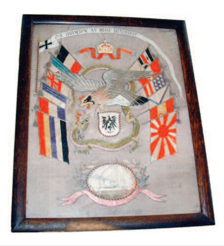
ZFC2430 Imperial German Naval Trapunto with panoply of international flags & image of German cruiser SMS Irene, dating from 1911 to 1914.