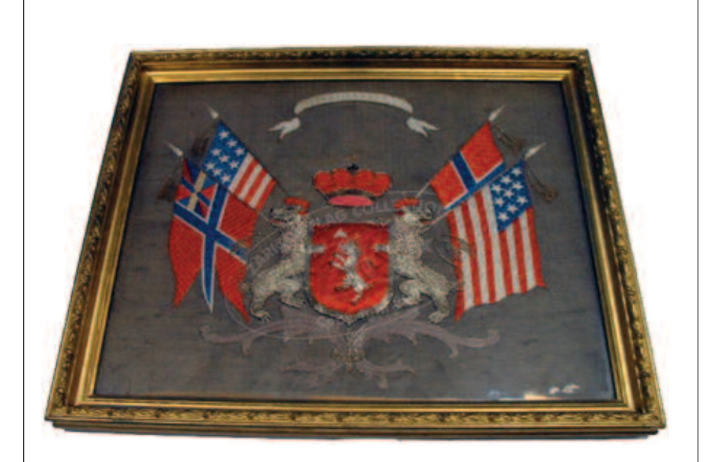
ZFC2068 Norwegian American Trapunto featuring the arms of Norway flanked by the Norwegian national flag and ensign and two stylized U.S flags with only 9 stars and 11 stripes. The motto on the scroll Brader Folkenes Val roughly translates "welfare to brother nations", a motto then in use on Swedish & Norwegian coins dating from 1890s to 1905.