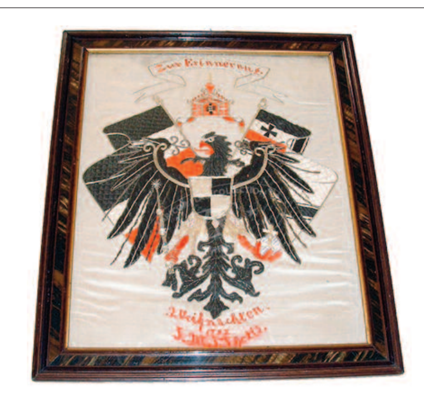
ZFC2428 Imperial German Trapunto with German national flag and naval ensign behind Imperial German arms dedicated to a crewman from the German Far East Squadron serving on the gunboat SMS Ilkis or "polecat", 1902.