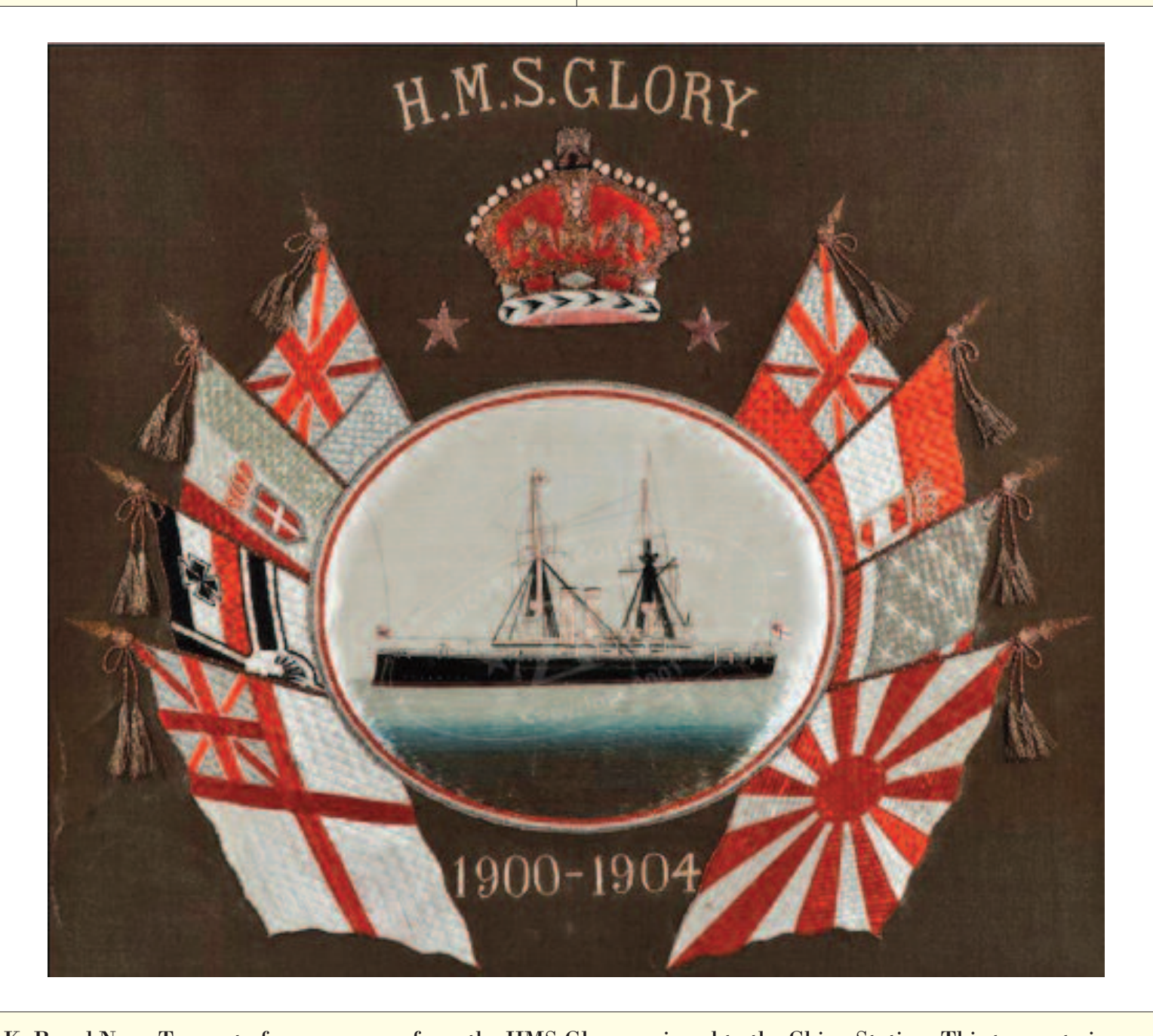
ZFC3699 U.K. Royal Navy Trapunto for a crewman from the HMS Glory, assigned to the China Station. This trapunto is a panoply of naval ensigns around an exquisite embroidery of Glory, surmounted by the Imperial Crown dating from 1900 to 1904.