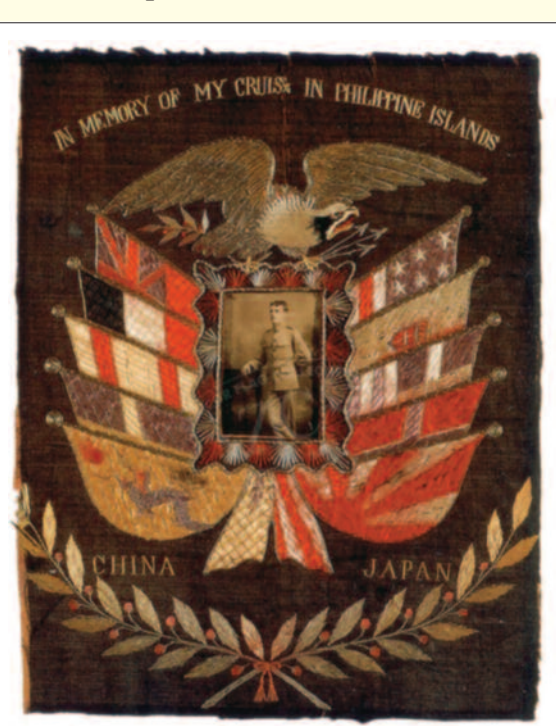
ZFC0742 American Trapunto eagle, arrows and olive branch and panoply of national ensigns with inserted portrait of unidentified U.S. soldier in khaki service uniform dating from 1898 to 1910.